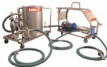
Shown with optional holding tank cart

A portable cleaning system containing everything needed to clean all sizes of tanks and totes on site. Features unmatched cleaning effectiveness combined with unbeatable convenience.