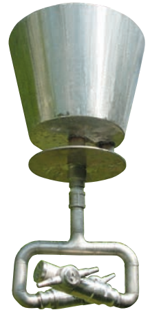
The manway adapter is a separate item.